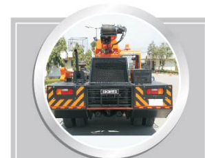
Rear view camera & integrated protected tail lights