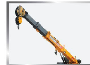
Safe Load Indicator