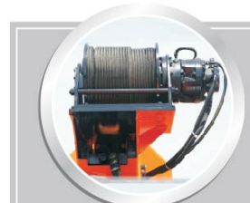
Heavy Duty Winch